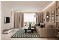
rays of sun to wake you up in the morning